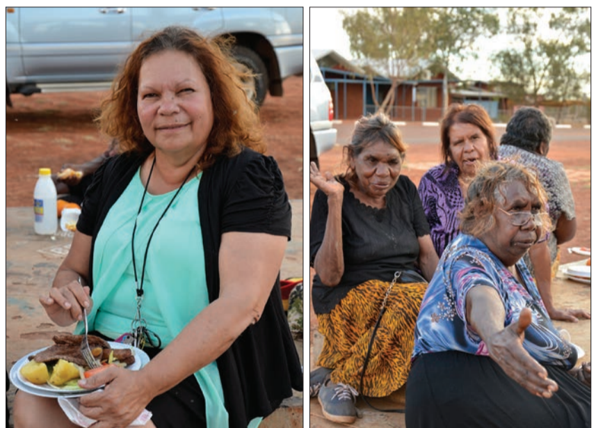
Right: Rangers at the Water monitoring workshop at the CLC's 2013 Ranger Camp at Gemtree