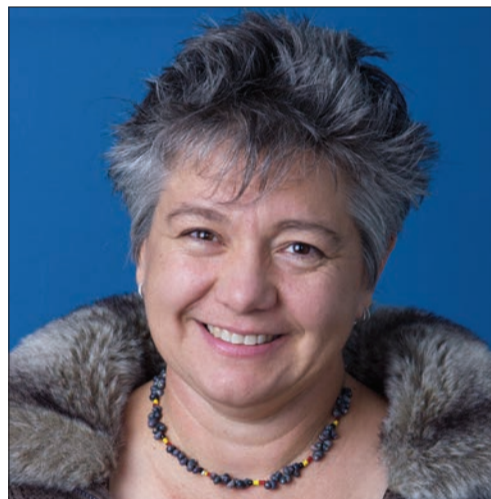
Above: Melissa Lucashenko

Author Kate Grenville has described Mullumbimby as "cheeky, thoughtful and real – a powerful novel about country and belonging."