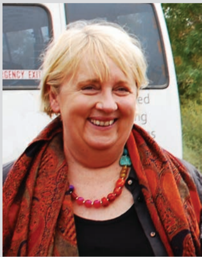
The Minister for Indigenous Affairs Jenny Macklin

If you want to talk to the government about next steps in developing strong alcohol management plans talk to your Indigenous Engagement Officer or Government Engagement Officer for your community.