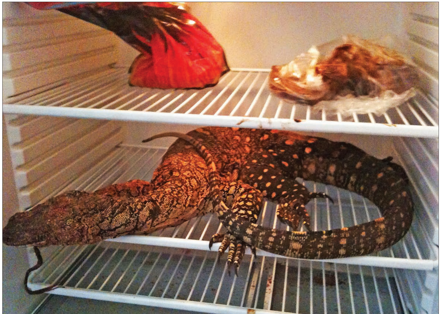
Chilled perentie - fast food but not fast enough