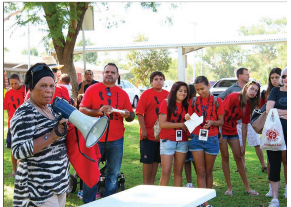
Below right: Youngfellas at Lajamanu School