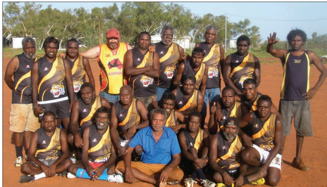
Above: The Oldstars took the game very seriously, as any seasoned veterans would... Below: But the Allstars had the edge when it came to running out the game.