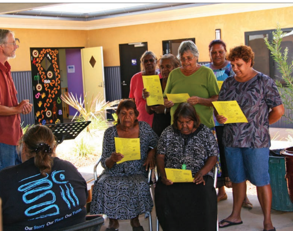
Women from the Hermannsburg Choir singing at the opening of the Women's Centre

She said: "The painting represents this building here, the circle in the centre represents the country and