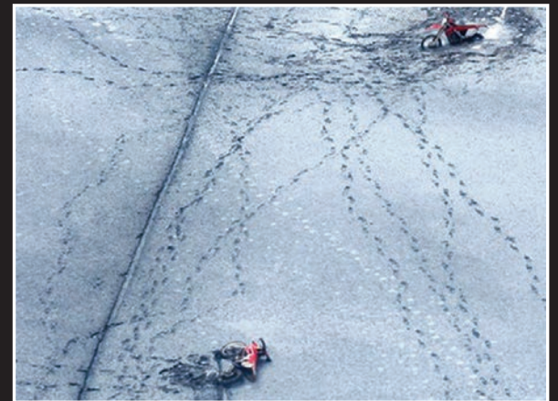
Above: Nowhere to hide — bogged and temporarily abandoned

TWO MEN employed by the resort at Yulara have been fined $140 for accessing Aboriginal land without a permit.