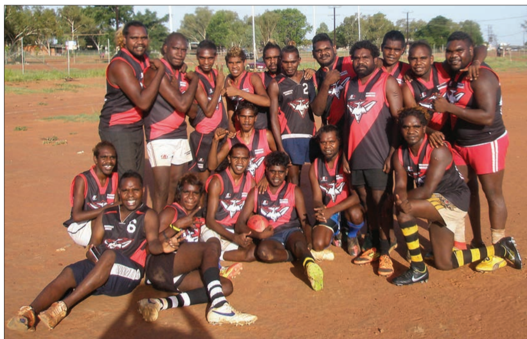
Below: Meanwhile, the Cats and the Suns had plenty of energy and youth to burn.