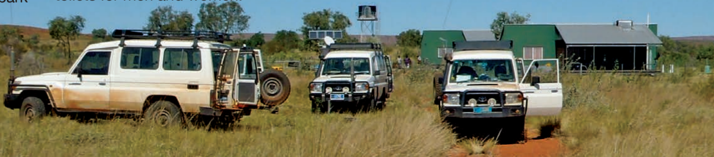
Iytwelepenty Davenport Range National Park - At Hatches Creek Outstation the site of the shelter

They also decided to use their rent money to support three schools in and near the park.