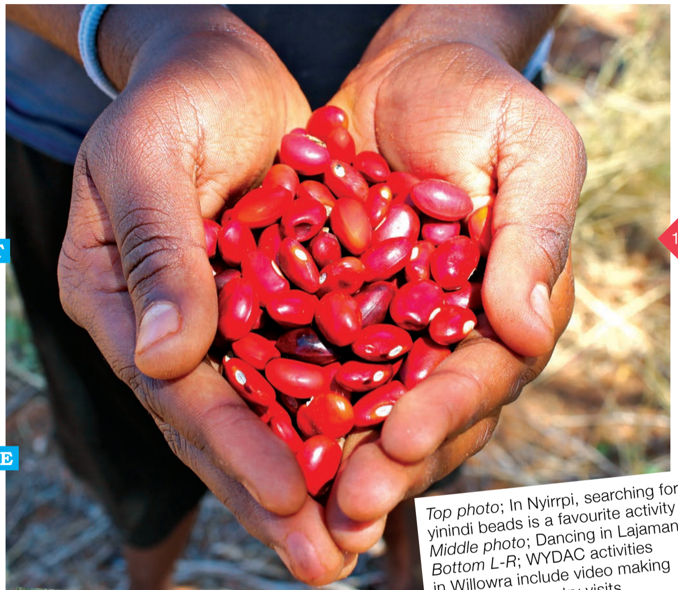
Top photo; In Nyirripi, searching for yinindi beads is a favourite activity Middle photo; Dancing in Lajamanu Bottom L-R; WYDAC activities in Willowra include video making training and country visits