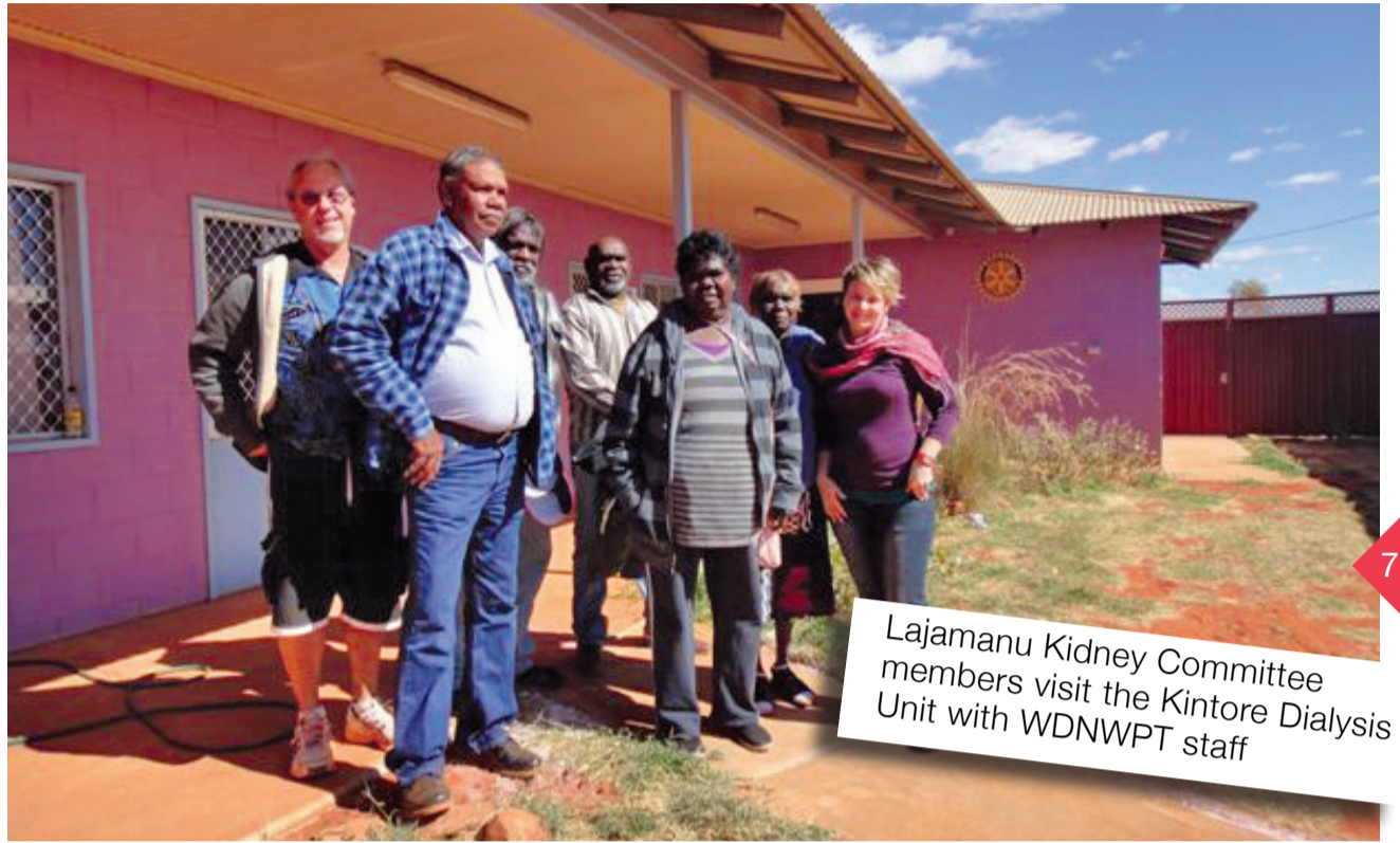
Lajamanu Kidney Committee members visit the Kintore Dialysis Unit with WDNWPT staff

New government funding for bores and rising mains in Lajamanu will ensure there