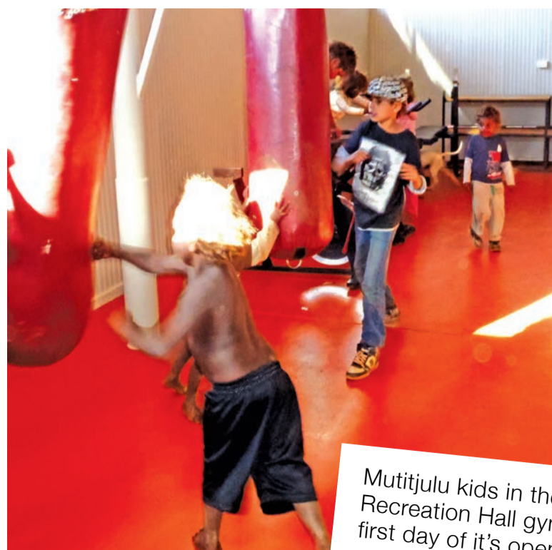
Mutitjulu kids in the restored Recreation Hall gym on the first day of it's opening

Families are glad to know their kids are safe at the hall.