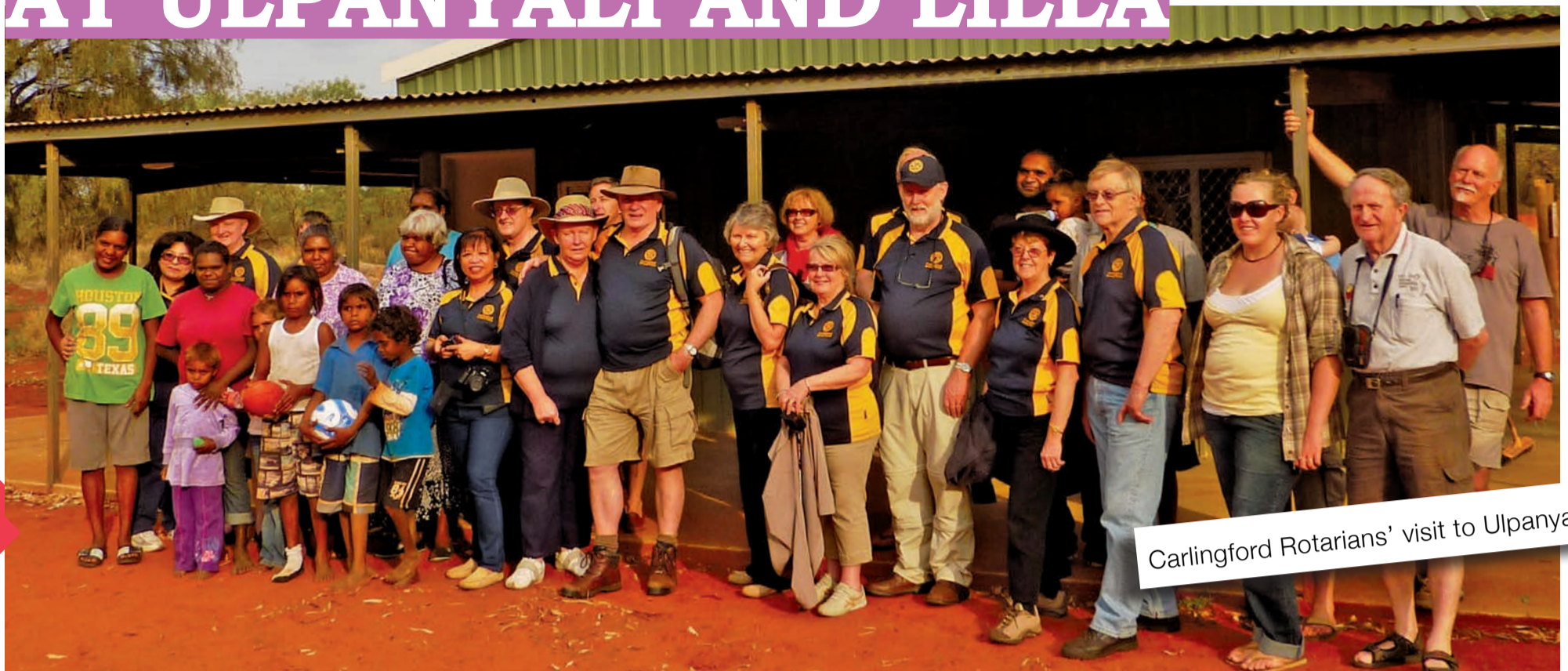
Carlingford Rotarians' visit to Ulpanyali

Ulpanyali and Lilla residents have welcomed 22 very helpful Rotary Club members to their communities